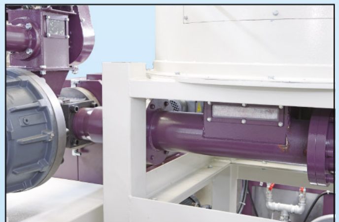
Side feeding screw conveyor