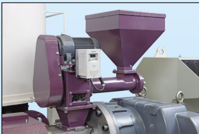
Rigid material feeding system